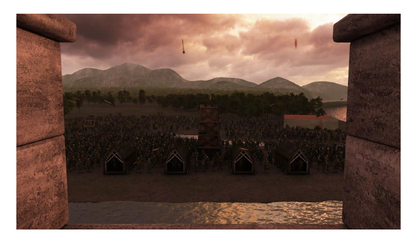
Fig. 4: Last frame from introduction movie. The enemies start the attack against the wall