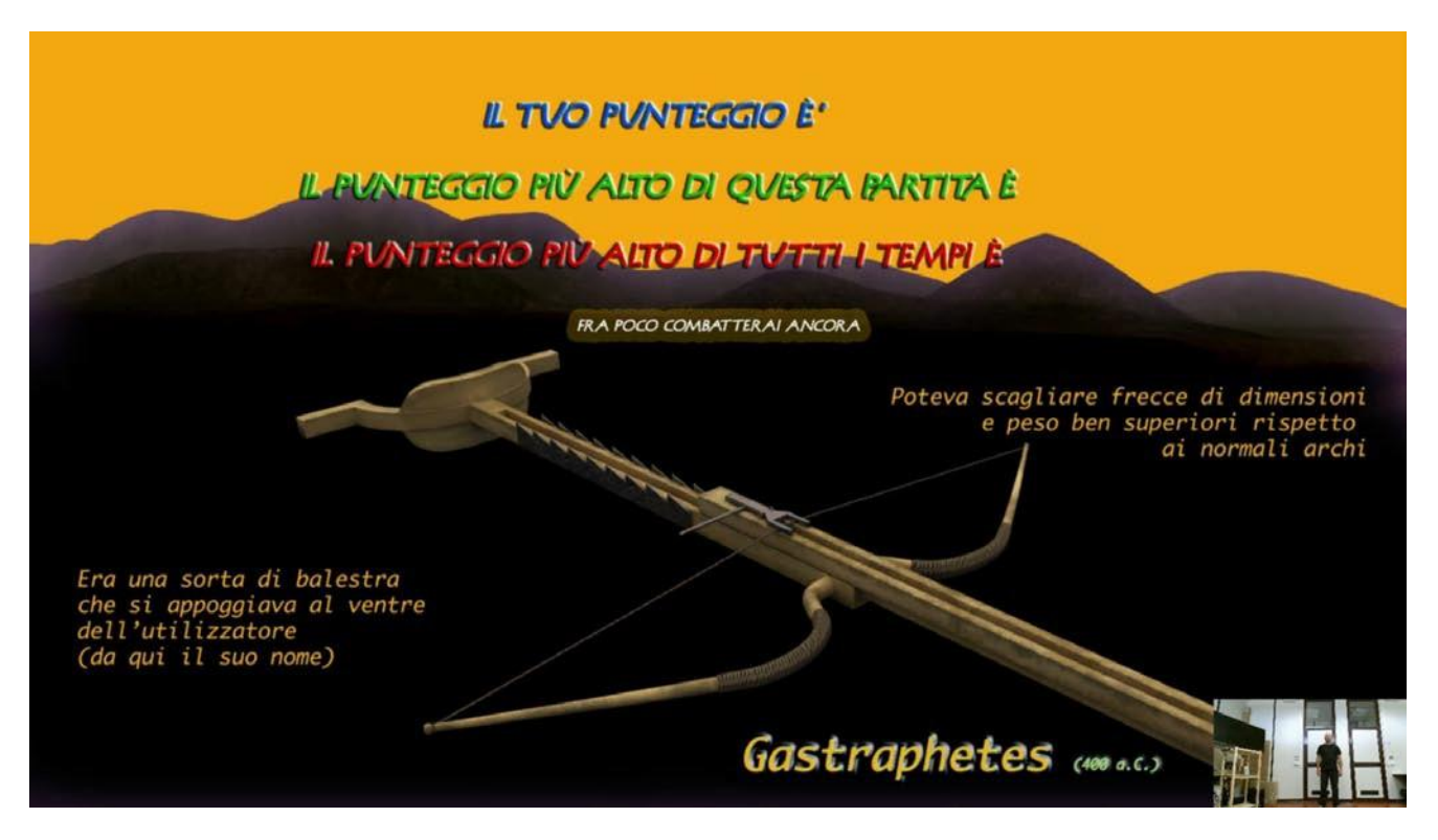
Fig. 7: Example of Score

phases, both important and designed with the aim to enhance each other. The first phase is represented by the vision of the introductory movie (consisting of pre-rendered 3d content), the second is represented by the game experience; this is done through gesture-based interaction. The paradigm of natural interaction has the task of allowing the player to avoid all the traditional game interfaces (mouse, keyboard, joystick, game controller, etc.) to gain the control on the experience of the game only thanks to the movements of his body (Pietroni & Antinucci, 2010; Featherstone & Burrows, 1995).