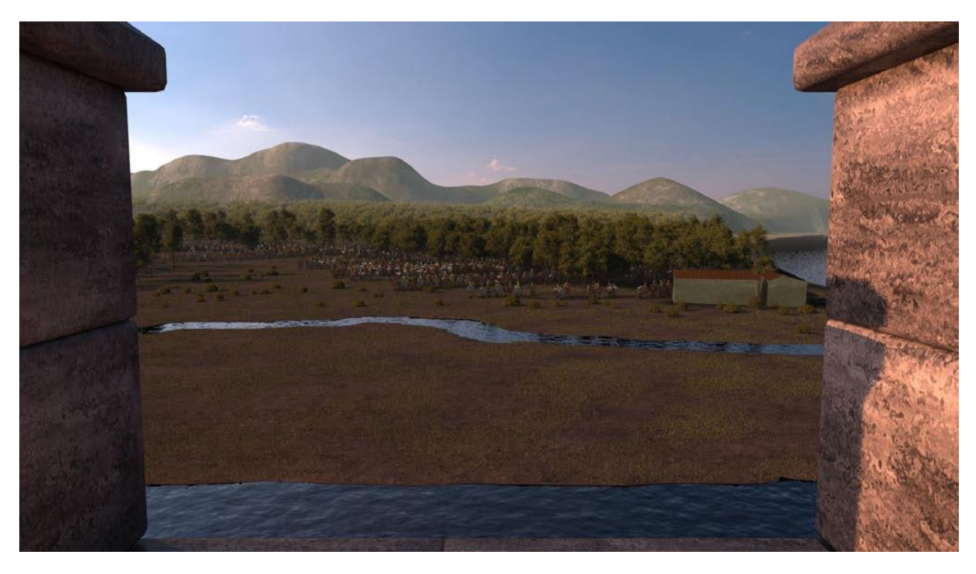
Fig. 1: Screenshot from the introduction movie. Soldiers coming out from the forest, seen from the tower