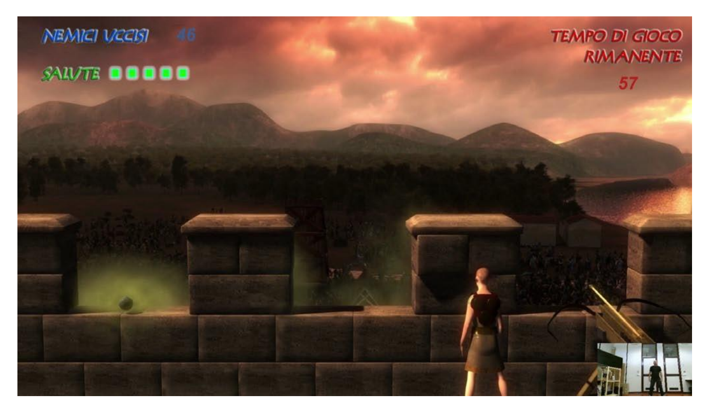
Fig. 5: Screenshot from the serious game. Defence action of the player

protect from arrows, stones and burning objects launched by the enemies (fig.5).