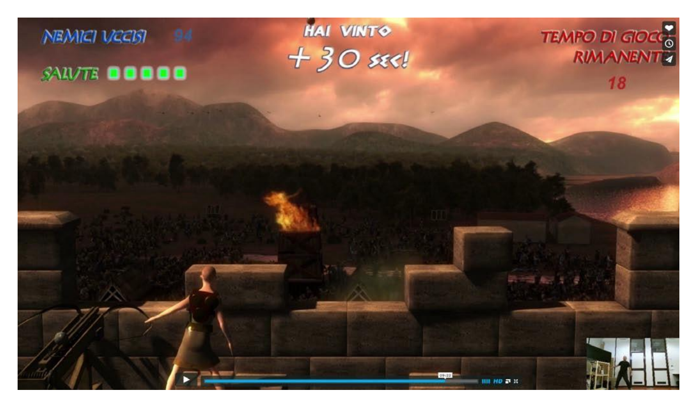
Fig. 6: Screenshot from the serious game. Attack action of the player using the war machine on the tower