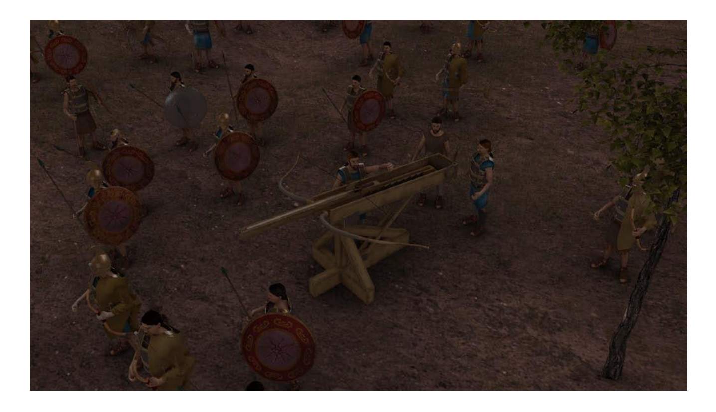
Fig. 3: Screenshot from the introduction movie. The soldiers loading an Oxybeles